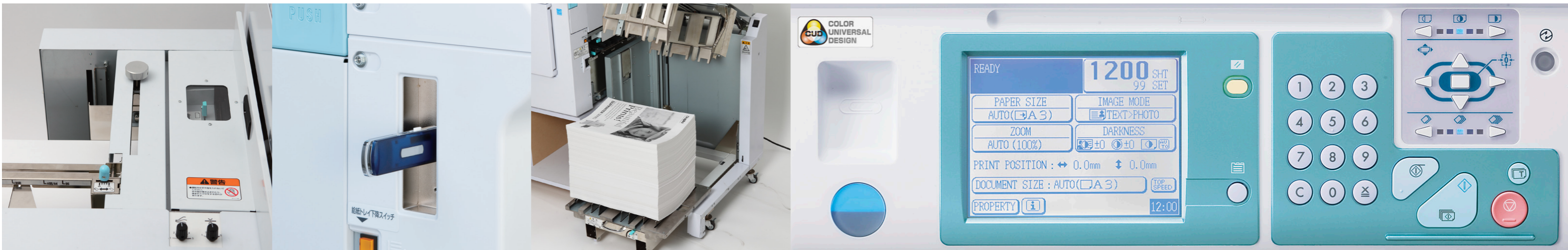
Unique suction feeder

Changing the print position is very simple. The directional arrows on the control panel allow the user to move the image even when printing!